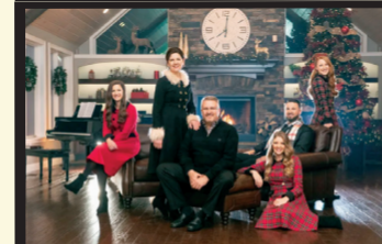
The Collingsworth Family