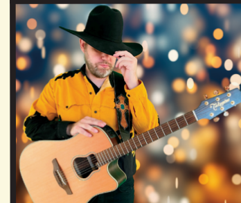
Key of G Live!

Enjoy the Excitement of Live Performance During our 85 TH Season 2023-2024